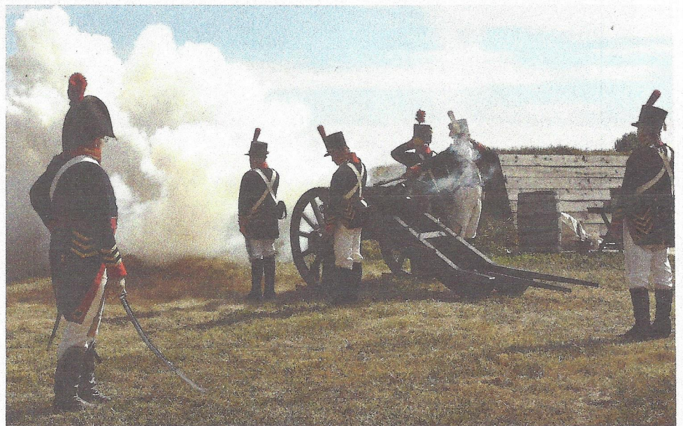
A 12-lb. naval landing gun, representative of the guns used by the Marines at St. Leonard's Creek and Bladensburg, is fired by these Marines at Fort McHenry National Monument and Historic Shrine in Baltimore.

Barney held his fire until the British were uncomfortably close, then blasted their lead columns with his well-served artillery firing grapeshot in naval broadside fashion.