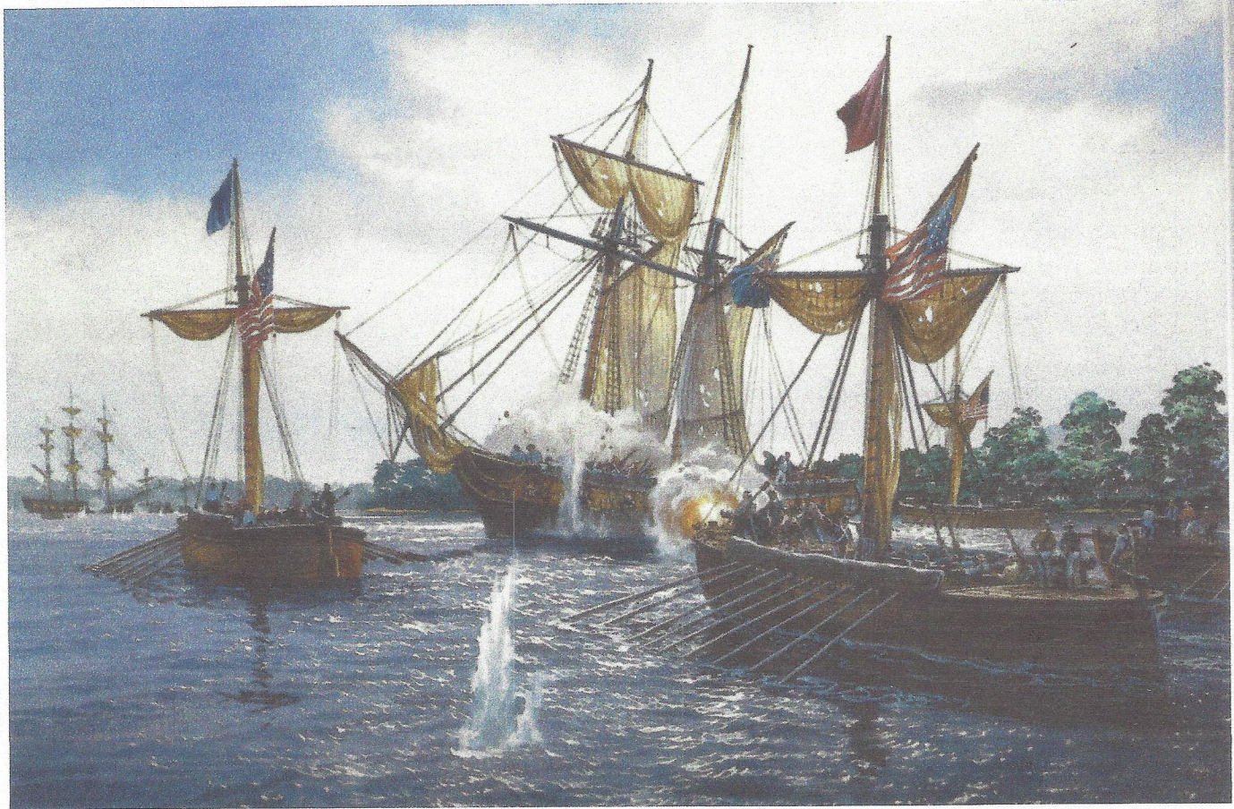
"Battle of St. Leonard's Creek," 10 June 1814