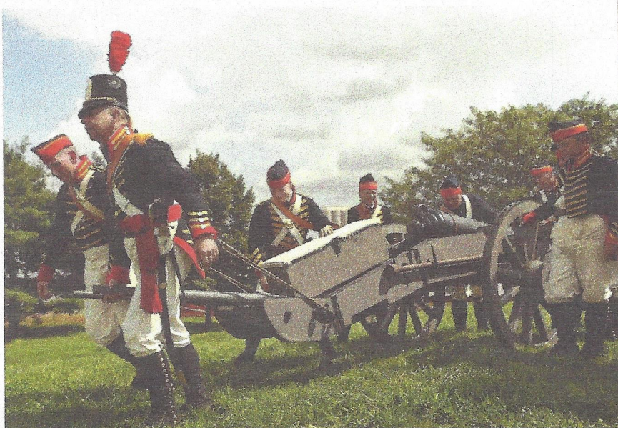
Marine power versus horsepower. Once ashore, landing guns such as this one had to be moved via manpower. These Marines use "bricoles," shoulder straps with ropes and hooks, to move the half-ton cannon into place.